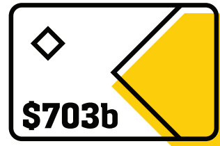
Government debt (36.1% GDP)