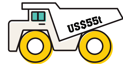
Iron Ore forecast